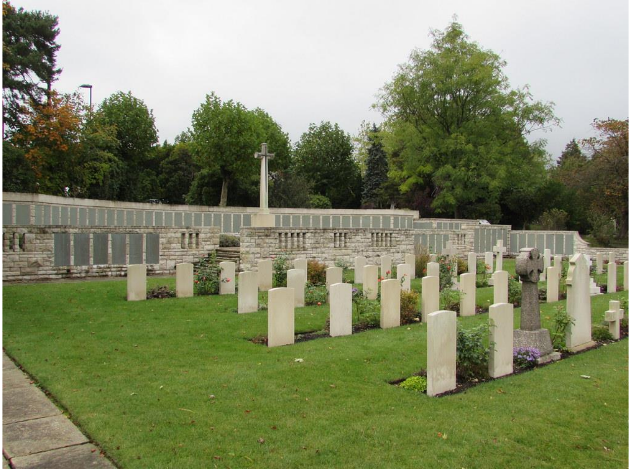
Hollybrook Cemetery with Hollybrook Memorial at front