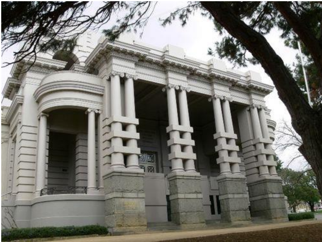
Geelong Peace Memorial