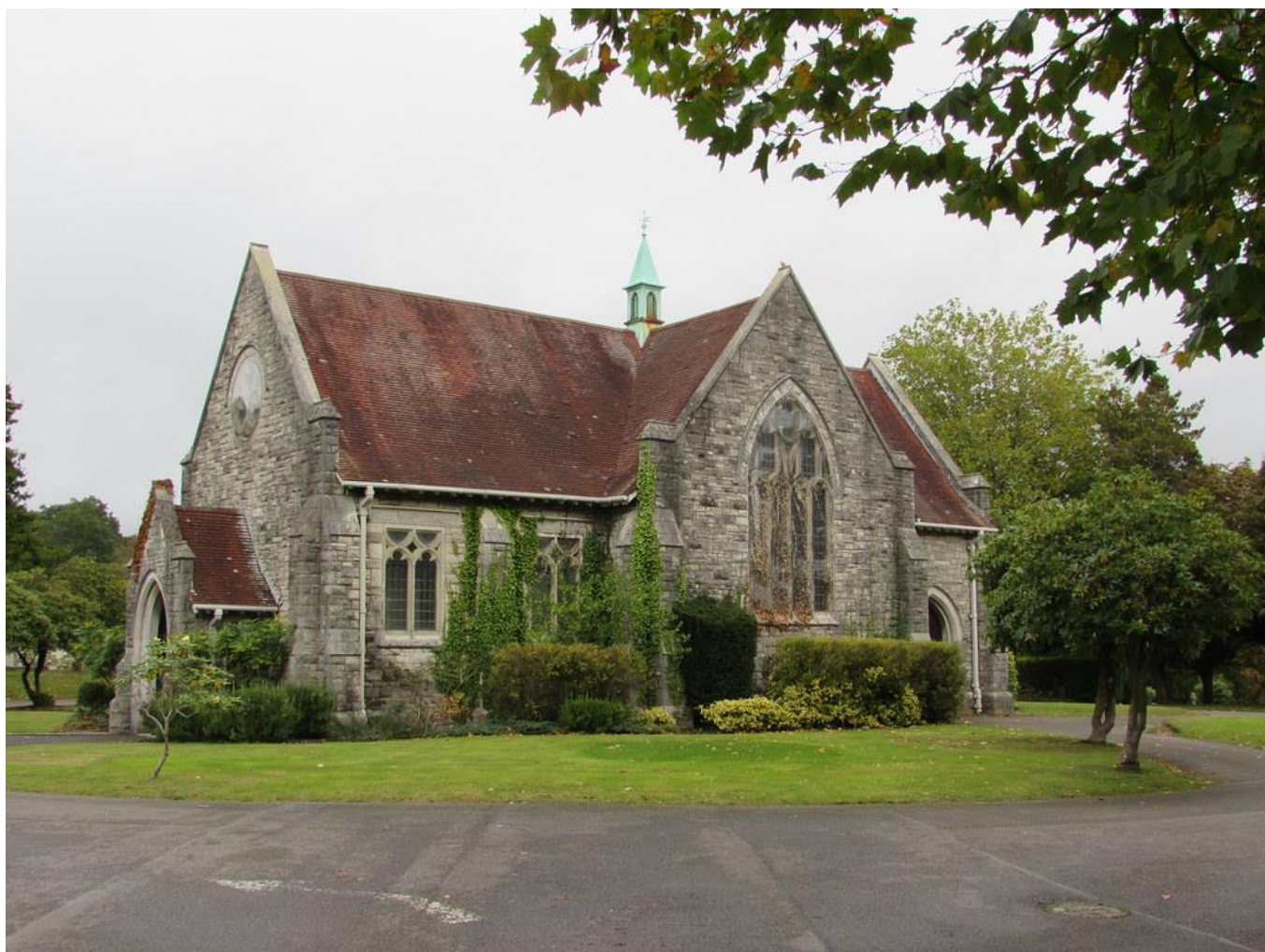
Chapel at Hollybrook Cemetery